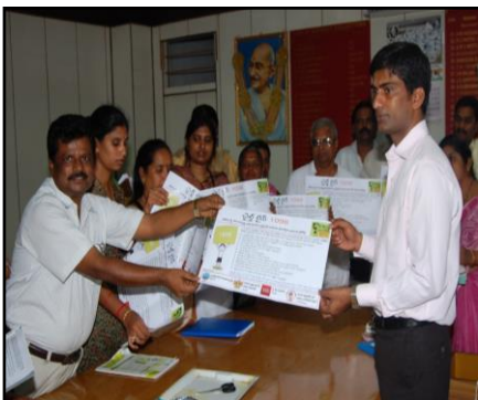
Dist. Collector Releasing CHILD LINE – 1098 Posters