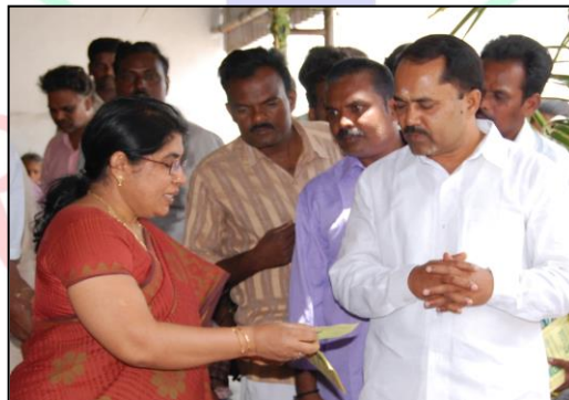
Explaining to Local MLA about CHILD LINE