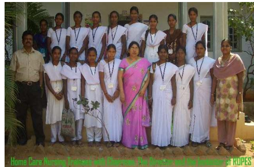
Home Care Nursing Students

A record number of 421 youth hailing from poor and needy families received vocational training in supply chain management, Home care nursing, computer literacy and tailoring during the year and as many as 380 youth selected by placement service for suitable employment in Apollo hospital, Chennai, Siva shakthi group of companies, Vinuthna fertilizers, More and reliance marts, dairies, browsing centers and are known to earn Rs 6000/- to 10,000/- per month in private firms and super markets in nearby towns.