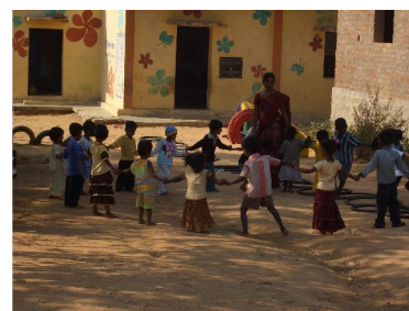
ELC children out door play

ROPES in partnership with TdH.NL lay the foundation for the psychological, physical and social development of children. During the year 136 new children were enrolled in our Early Learning Centers.